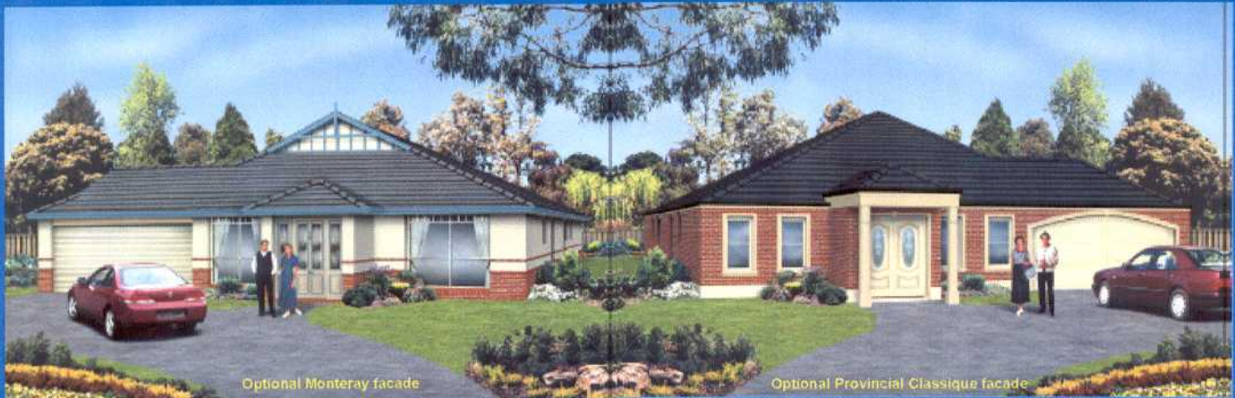
Optional Monterey facade